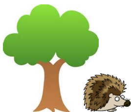
L Sellars Headteach